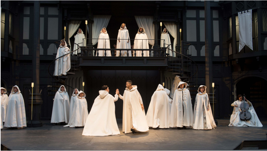
Ensemble in Romeo and Juliet , dir. Dámaso Rodríguez. Oregon Shakespeare Festival, 2018.

dimensionally; which is to say, by seeing characters that look like oneself. The presentation of the ensemble primed the audience for this particular horizon of expectation: the performance opened with the entire cast entering the faux-Elizabethan outdoor playhouse wearing matched white, floor-length hooded cloaks. They each took a line of the prologue rather than invent a figure for its delivery, and then took seats on makeshift benches ringing the stage. At each speaker's first entrance (that is, when they first spoke), they cast off their cloak rather than coming from off-stage. It is a technique Rodríguez has used before, as in the opening gambit of street carolers communing over a garbage fire to begin Artists Repertory Theatre's hit production A Civil War Christmas back in 2016. Making explicit that the actors are drawn from a world outside that of the play—contemporary US society—invited audiences to participate in the imaginative construction of the performance experience.